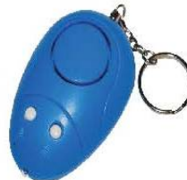
Keychain Alarm w/Light [PAL-130L]