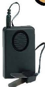
130db Alarm w/Door Alarm [PAL-1]